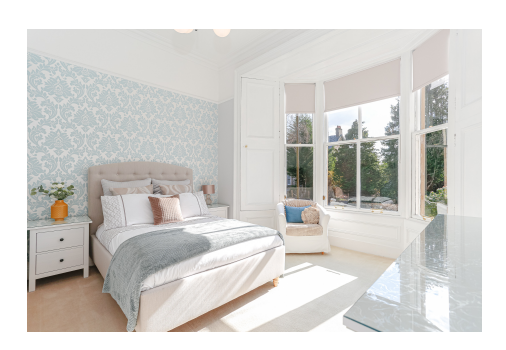
3 Beds | 1 Bath | 104m2