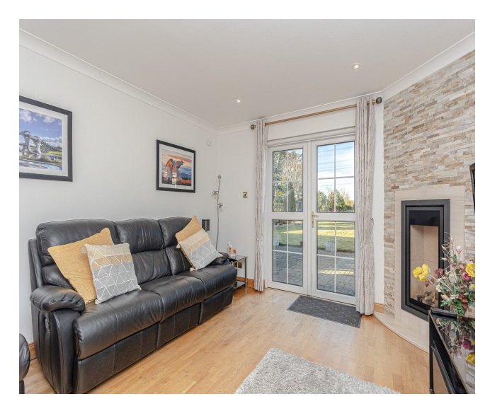
4 BED | 5 BATH | 261m2