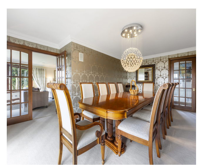
4 Beds | 3 Baths | 290m2