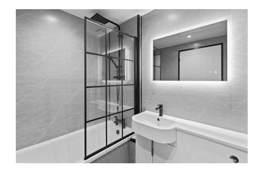
2 Beds | 2 Baths | 58m2