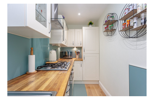
2 Bed | 1 Bath | 51m2