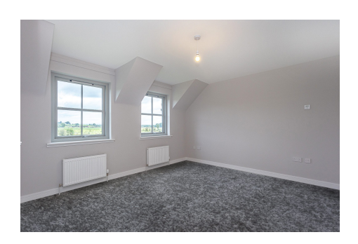
5 Beds | 3 Baths | 2 Receptions