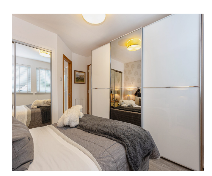
3 BED | 3 BATH | 109m2