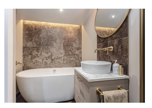
3 Bed | 1 Bath | 75m2