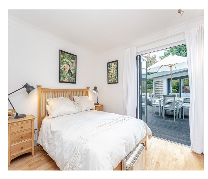
4 Beds | 2 Baths | 159m2