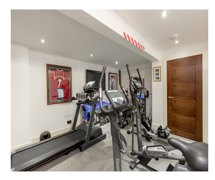
4 Beds | 3 Baths | 401m2