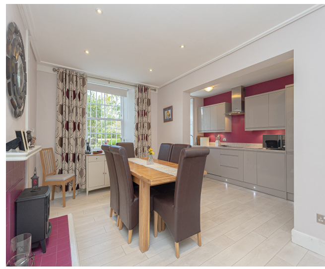
7 Beds | 4 Baths | 664m2